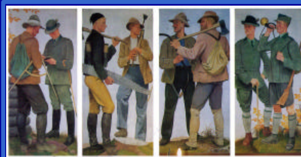
Forestry as it was seen in the 1930ies

Some of the women quit their studies without certificate in order to do war service as nurses or alike. During and shortly after the war the women worked as scientists at one of the forestry institutes in Hann. Münden or in forestry offices as administration secretaries. With the return of the men at the end of the war most of the female foresters disappeared silently. Almost all of them married - predominantly foresters - and became housewives. Two women became forestry professors - more or less accidentally because of their specialisation on exotic topics.